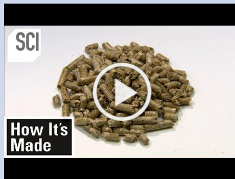
Manufacturing process of wood pellets

The use of wood pellets as an energy source has gained increasing popularity recently due to its environmental and economic advantages over primary fuels. Woody biomass or finished wood pellets can be further processed to produce torrefied, or black, pellets. Black pellets are hydrophobic, which makes them easier to transport and store, and have a energy density that is comparable to coal. As of 2021, California has two active wood pellets manufacturing facilities located in Rocklin and Ukiah, producing 140,000 tons of pellets per year.