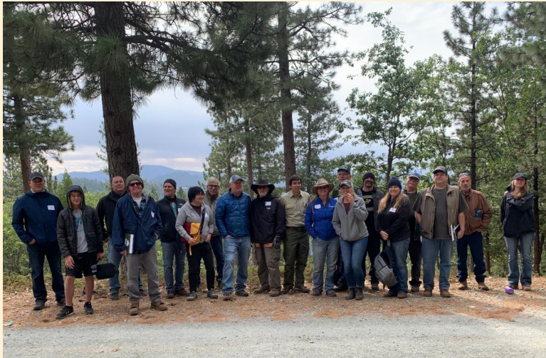
Forest Stewardship and MSW Tuolumne Project Field Day Participants