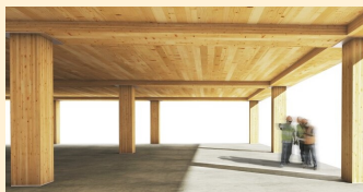
Engineered wood products

Our forests provide a lot more than woody biomass. In Part 2, we will explore more about biomass-based products and forest products beyond bioenergy and pellets.