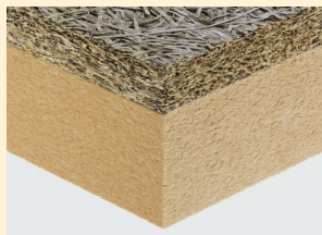
Wood fiber insulation