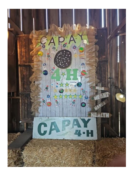
Figure 1: Capay 4-H Club Window Display