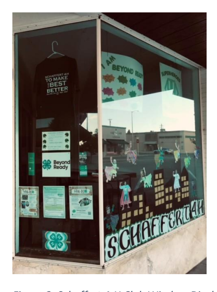
Figure 2: Schaffert 4-H Club Window Display