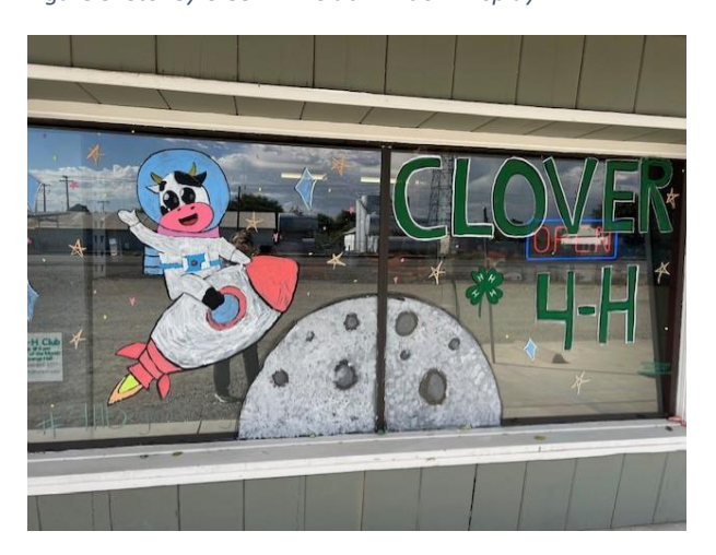
Figure 4: Clover 4-H Club Window Display