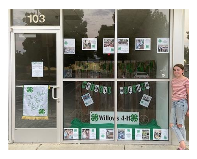
Figure 5: Willows 4-H Club Window Display