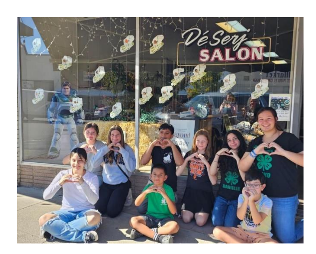
Figure 3: Stoney Creek 4-H Club Window Display