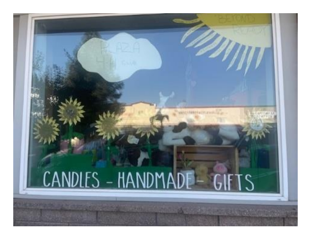
Figure 6: Plaza 4-H Club Window Display