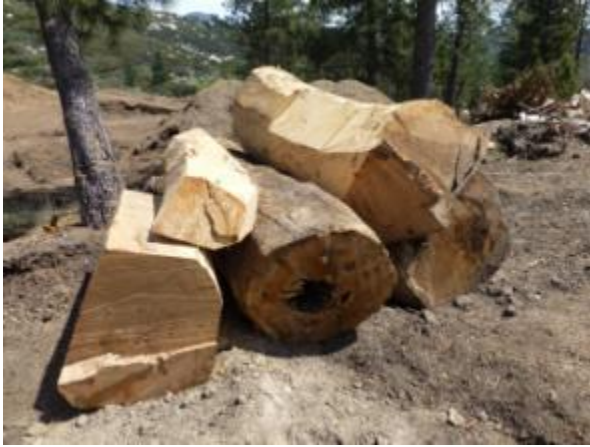
1. Infested wood is cut into bark-free cants