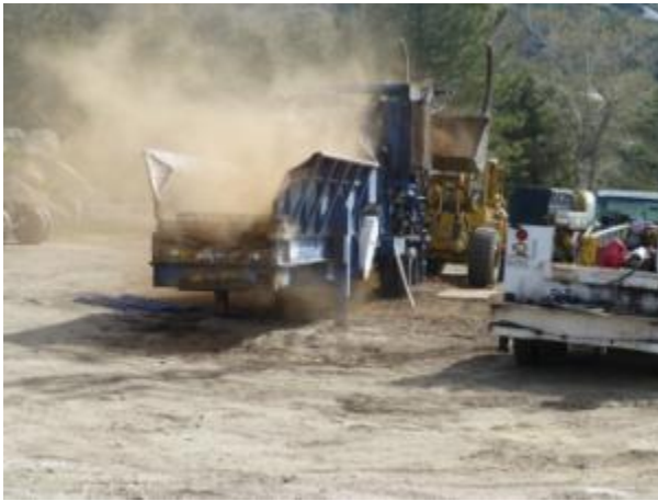
3. Infested wood/bark is ground