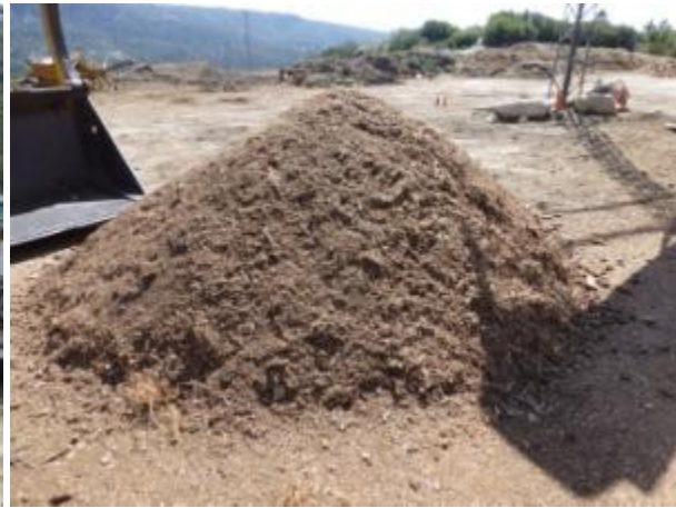
4. Ground material

5. Ground material was placed inside of sealed barrels where GSOB traps will be affixed to the barrel tops. Monitoring will occur through the flight season to determine if any GSOB emerge post-treatment.