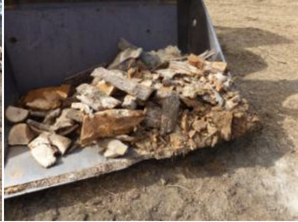
2. Infested portion of the wood/bark