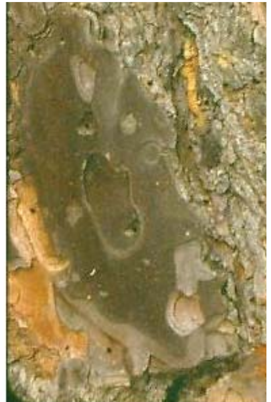
Figure 6. Outer bark partially removed by woodpeckers