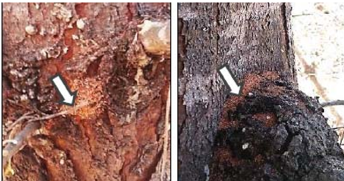
Figure 2. Boring dust accumulation on spider web (left) and branch (right).

When a tree dies from attack, its foliage changes color from green to yellow and eventually reddish brown. This change takes time. Immature beetles may complete their development, emerge as adults and fly off before symptoms are noted.