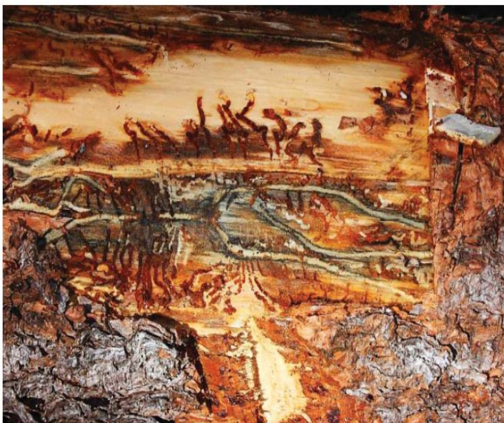
Figure 5. Bark Beetle galleries