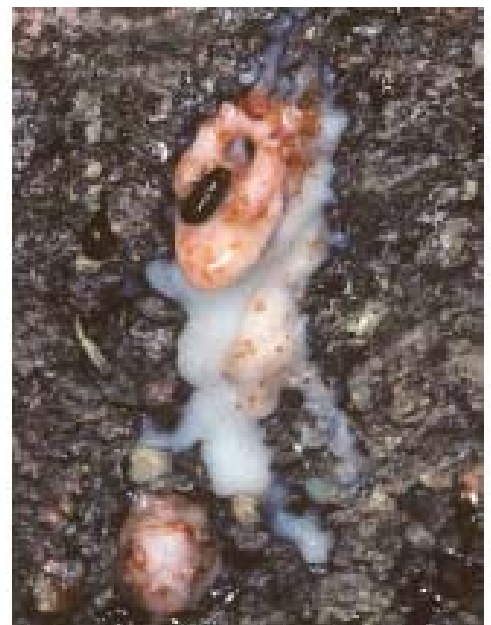
Figure 1. Mountain pine beetle and pitch tube on lodgepole pine

Pitch tubes, pitch streaming down the trunk and boring dust are signs of bark beetle attack on conifers. On hardwoods, the signs are bleeding, frothy or wet spots on the bark, or powdery boring dust.