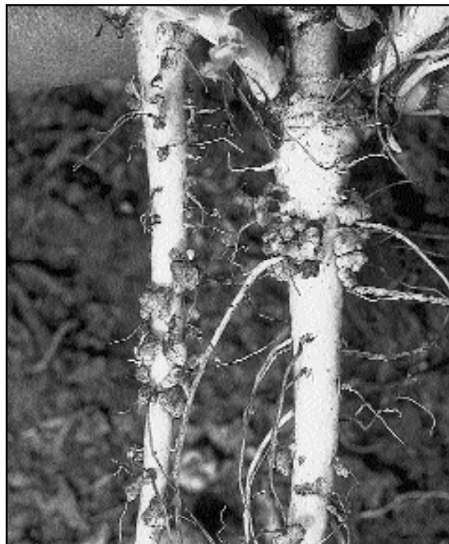
Figure 4-2. Nodules created by nitrogen-fixing rhizobia on berseem clover.

Nitrogen production and availability. Research indicates that legume cover crops can fix from 50