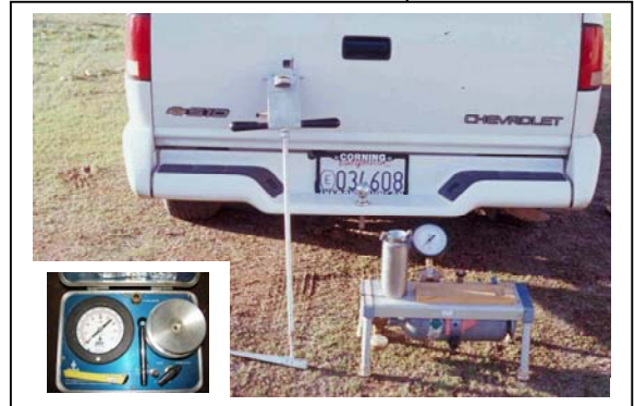
Figure 1. Three commercially available pressure chambers for measuring midday stem water potential in walnut.

Figure 1 with inset shows three different types of pressure chambers. Presently, there are two manufacturers of pressure chambers, PMS Instrument Company and SOILMOISTURE Equipment Corporation. Both manufacturers have websites describing their equipment. Typical prices range from roughly $1400 for the "manual Pump-up" model in the middle and as high as $4400 for the "gas pressured console" on the right in Figure 1. The gas console shown in the inset costs about $2000 - $2800 depending on specific features.