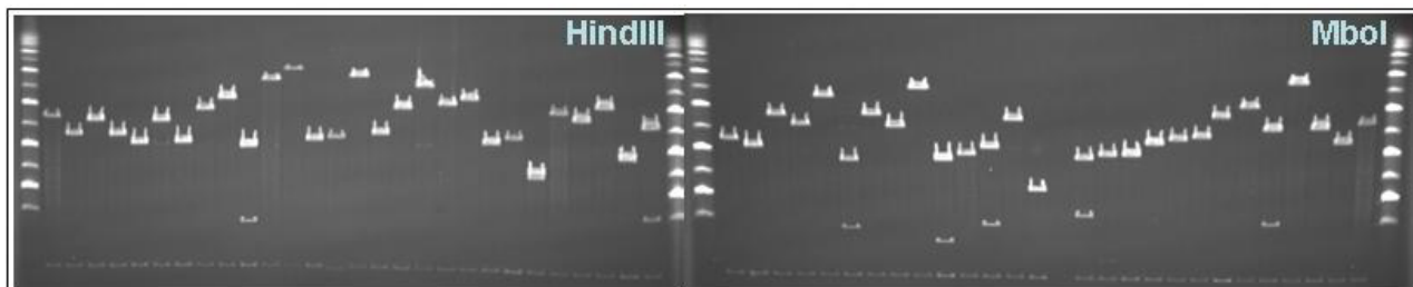
Fig 2: Size distribution of BAC inserts obtained by pulse field gel electrophoresis, Hind III BACs (left) and Mbo I BACs (right). The 25 kb ladder markers are shown on both sides of each gel.

Construction of two walnut BAC libraries: Two bacterial artificial chromosome (BAC) libraries were constructed from in vitro grown shoots of Persian walnut ( Juglans regia cv. Chandler) using cloning enzymes Hind III and Mbo I. A total of 129,024 clones, 64,512 per BAC library, were arrayed in 336 384-well plates. The average insert size was around 135 kb and 120 kb for the Hind III and Mbo I libraries, respectively (Fig 2). Assuming the walnut genome is approximately 800 Mb, these two BAC libraries represent ca. 20x genome equivalents. Each BAC library was stored in triplicate. BAC fingerprinting and BAC end sequencing will be initiated in the middle of January, 2008.