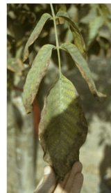
Chandler on Paradox ( J. hindsii x J. regia ) rootstock