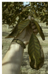
Chandler on English ( J. regia ) rootstock