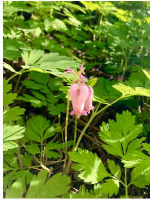
Western Bleeding Heart – Dicentra formosa

Gardeners in Tahoe praise this perennial shrub for being tough as nails. It can tolerate heavy snow loads, dry to wet well-drained soil, shade and sun – truly adapted to our Tahoe growing conditions. Nothing says spring like a Sierra currant. It is one of the first shrubs to bear its spring green leaves and pendulant pinkish-red flowers that ripen to edible bluish-black berries at summer's end. Currants attract pollinators and birds alike. This is a medium to large shrub so give it room to grow to its full potential.