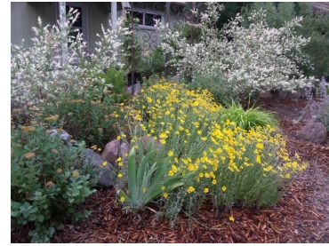
Oregon Sunshine / Woolly Sunflower – Eriophyllum lanatum

Sourcing this graceful spreading ground cover was a real find. It is native to the western Sierra Nevada slopes and thrives in shade in dry or moist well drained soil, shade, perfect for the understory shade garden. After dying back to the ground each winter, this sweetheart of a bloomer quickly grows to 10-15 inches tall and boasts delicate heart-shaped flowers April through June providing nectar to hummingbirds and butterflies.