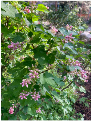
Sierra Currant – Ribes nevadense

Gardeners in Tahoe praise this perennial shrub for being tough as nails. It can tolerate heavy snow loads, dry to wet well-drained soil, shade and sun – truly adapted to our Tahoe growing conditions. Nothing says spring like a Sierra currant. It is one of the first shrubs to bear its spring green leaves and pendulant pinkish-red flowers that ripen to edible bluish-black berries at summer's end. Currants attract pollinators and birds alike. This is a medium to large shrub so give it room to grow to its full potential.