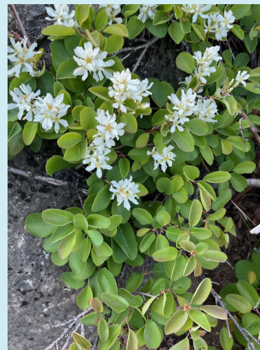
Amelanchier alnifolia (Western Serviceberry)