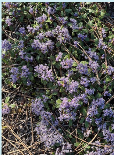
Ceanothus prostratus (Mahala Mat)

Check out a few native plants that are blooming or have just finished their flowering period: Pictured above from the forest near Zephyr Cove is Senecio integerrimus (Single stem groundsel). Below see Ceanothus prostratus (Mahala Mat), a low growing green leaved perennial which spreads across the forest floor. The photo shows its purple blossoms. Also pictured in bloom is the Sierra Currant, or Ribes Nevadense with the pink blooms, and the Western Serviceberry, Amelanchier alnifolia with the delicate white blossoms. All three of these shrubs shown below can be grown in your backyard and are low fire risk plants.