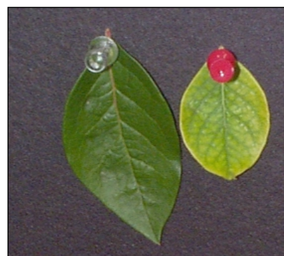
Figure 1.—Normal blueberry leaf (left) and iron-deficient leaf (right). Note the pale green leaf area and contrasting green veins on the iron-deficient leaf.