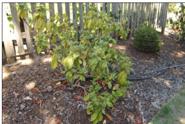
Figure 2.—Yellowed leaves do not always indicate that the soil pH is too high. This rhododendron is growing in soil with a pH of 5.4. Always check the soil pH before deciding to acidify your soil.