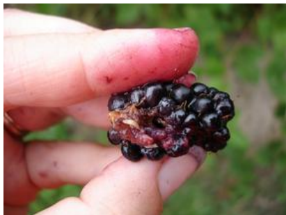
Spotted wing drosophila larva