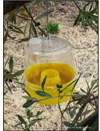
Figure 5. McPhail trap.

Management: Biological control appears to be limited and there are currently no chemical controls registered specifically for this pest on California figs. As such, orchard sanitation is critical, and growers should make sure to remove and destroy any BFF-infested fruits. Larvae in infested fruit are protected from pesticide sprays and there are no effective soil drenches for pupal control. Insecticidal baits (e.g. GF-120 NF Naturallyte®) may be useful for control of adult BFF but note that label rates have not been directly tested for efficacy against this pest. Consult with a licensed pest control adviser and your County Agricultural Commissioner before applying any chemical controls.