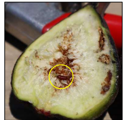
Figure 4. BFF pupa found inside of a fig.