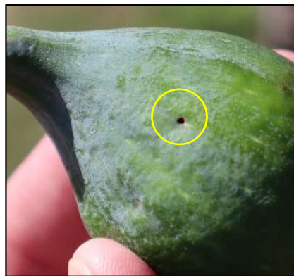
Figure 3. Exit hole from larva burrowing out of the fruit.