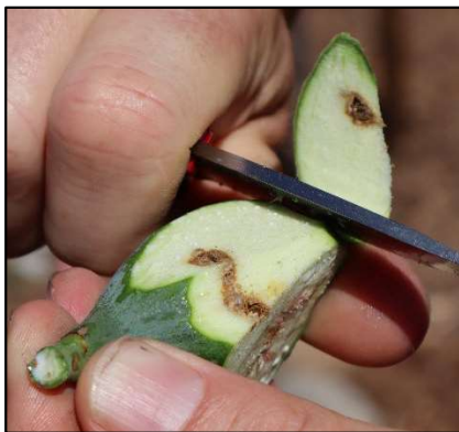
Figure 2. Internal damage to the fig from larval feeding.