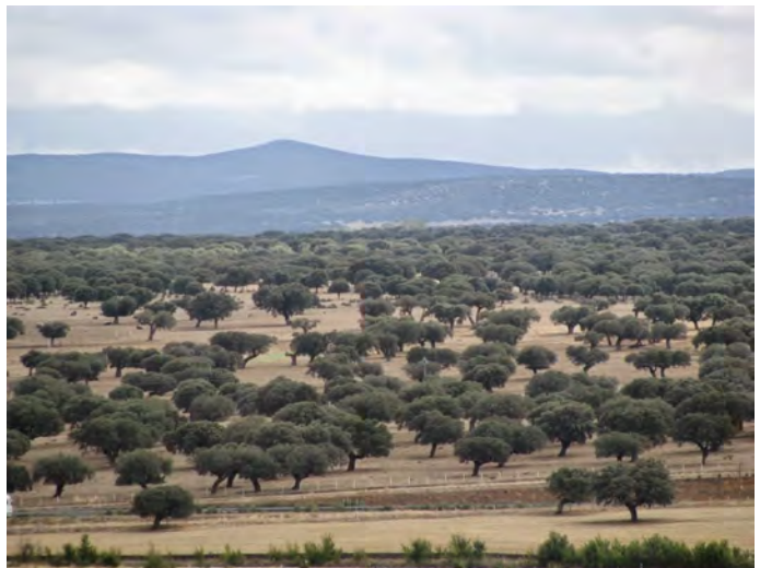
Spanish dehesa .

Californians interested in raising pigs on a mixture of pasture and acorns can learn much from the Spanish experience.