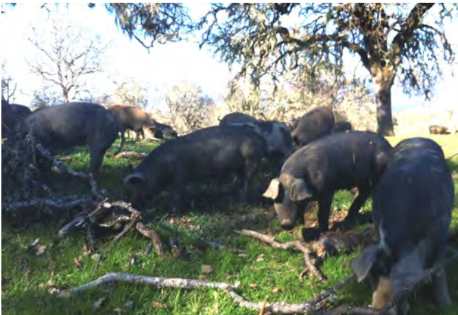
Hogs foraging in a California oak woodland.

California producers can learn from the Spanish experience in producing high quality pork products fattened on acorns. However, the introduction of pigs into the oak woodland can cause impacts to the ecosystem, and producers should evaluate their pastures for wildlife utilization and adopt appropriate and flexible stocking rates that adapt to seasonal changes in forage productivity of both acorns and