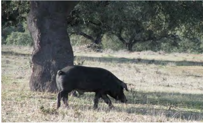
Pig foraging in the Spanish dehesa .

densiflorus ), a relative of the oak, are commonly found in the northern Coastal Range of California and produce nuts that are similar to acorns which can be utilized by pigs.