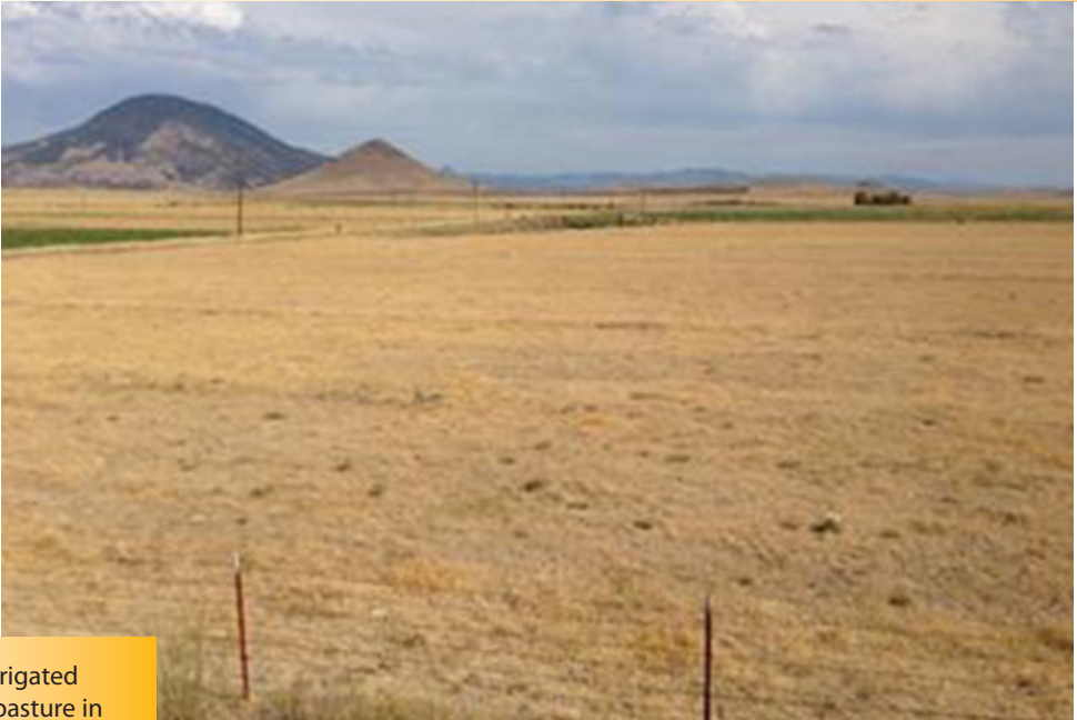
Figure 1. Irrigated tall fescue pasture in Shasta Valley, Siskiyou County, CA, after a season with only one spring irrigation, August 2014.

occasionally timothy (Phleum pretense L.) in wetter sites. These cool-season grasses differ in drought tolerance, with studies ranking their drought tolerance, in order from highest tolerance to lowest, as tall fescue, orchardgrass, perennial ryegrass, and timothy (Waldron et al. 2002; Orloff and Putnam, unpublished data). Bromegrass species are another cool-season grass option for managing drought. Research has shown the yield of meadow brome and smooth brome to be less affected by deficit irrigation than tall fescue, orchardgrass, or perennial ryegrass (Waldron et al. 2002). Smooth bromegrass and timothy are better suited for intermountain and coastal areas of California and generally are not well adapted to Central Valley locations.