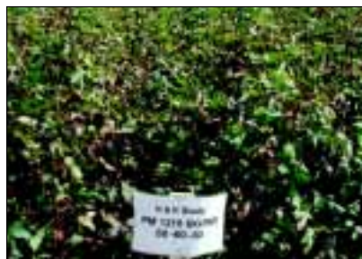
Figure 3. Cultivar differences in canopy appearance at 114 days after planting in 2004 at Jackson, Tennessee.

remobilization of carbohydrates in these cultivars, to improve their efficiency.