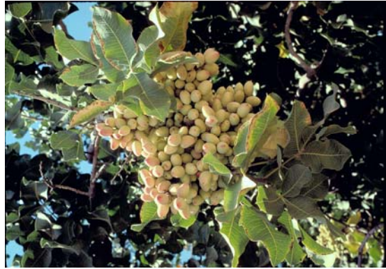
Figure 2a and 2b: Potassium deficiency in leaves immediately adjacent to almond (2a) and Pistachio (2b) fruits. Leaves on these trees not directly associated with fruit were not deficient according to current UC standards.