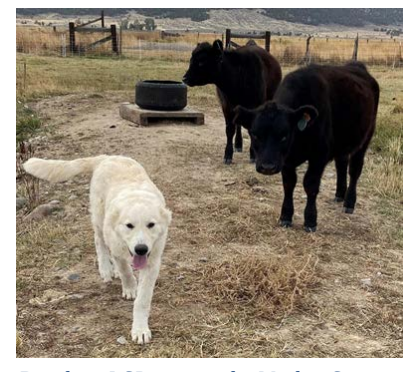
Bonding LGDs to cattle, Modoc County.