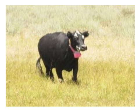
Demonstrating use of GPS collars on range cattle, Plumas County.