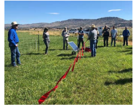
Field day demonstrating fladry use, Lassen County.