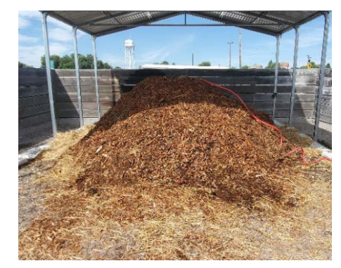
Carcass composting research, Intermountain Research and Extension Center, Siskiyou County.