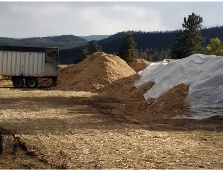
Figure 2. Mulch ready to be installed as a hill slope treatment shortly after the High Park Fire in 2012.

called hydrophobicity. This hydrophobic condition increases the rate of water runoff and can overwhelm water bodies in the event of thunderstorms. Commercially available straw wattles and silt fences can be purchased and installed in areas where runoff is more dispersed over a broad flat area.