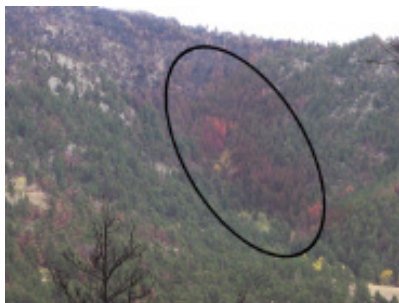
Figure 1. Fire retardant seen on trees two months after the High Park Fire in 2012.

Following a wildfire, the primary source of contamination to drinking water is from chemicals and microorganisms that can enter a fire-damaged well system. Human health could be adversely affected from either short or long term exposure to contaminants in the water and sediment may cloud water, or cause it to taste or smell smoky or earthy. Moreover, fire retardants can cause water to temporarily turn a reddish color. Fire retardants, made up of ammonium based compounds containing phosphate or sulfate, are usually red in color due to a small percentage of iron oxide (Figure 1). Generally considered harmless to humans and land animals, fire retardants do have some level of toxicity to aquatic organisms. The most toxic component of a retardant product is the corrosion inhibitor. If a fire retardant was used near a wellhead, it could possibly seep into the well over time, particularly if the wellhead was damaged, or if it is located in an area where storm water drains. In these situations, monitoring ammonia and nitrate concentrations for a period of several months is recommended.