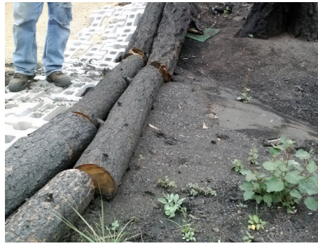
Figure 3. Sediment collected at the front of a log dam.

Replacing lost organic matter on the soil surface will help to initiate the microbial activity that is important for reducing the hydrophobicity of the soil. Spreading pine needles or large organic material near streams or ponds to intercept runoff is also a common practice.