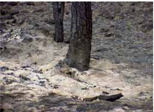
Figure 2b. Tree survival is low where leaves, roots, logs, and debris build up around the base of trees. Intense heat is the result, and the cambium layer is destroyed.

Bark: For a conifer to survive, some roots, the cambium of the main trunk and buds must survive. The cambium is the sensitive layer of growing cells that produces the vascular system that conducts water and nutrients throughout the tree. The bark insulates the cambium from the damaging intensity of a fire; the thicker the bark, the better the protection.