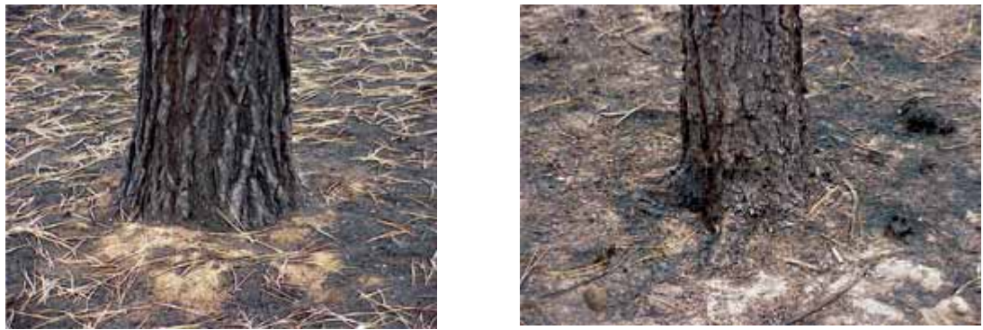
Figure 2a. Tree survival is greater where fire temperatures are low and roots do not receive intense heat.

A conifer's (e.g., pine and juniper) ability to withstand fire damage is based on the bark thickness, root depth, needle length, bud size, and degree of scorch. They are limited in their ability to reestablish themselves after a fire. Unlike some deciduous trees and shrubs, the root systems of conifers (except shortleaf pine) do not regenerate from new vegetative stems or 'sucker sprouts' after the top is killed.