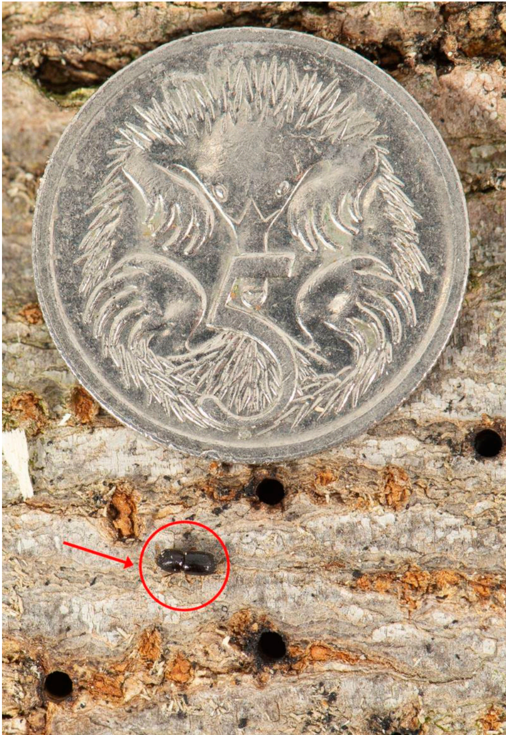
Polyphagous shot-hole borer

Just 2mm in size, the pest was first detected in East Fremantle in August, after a resident reported signs of dieback and dead branches in their maple tree. Since then, further borers have been detected in Claremont, Myaree, Dalkeith and Attadale.