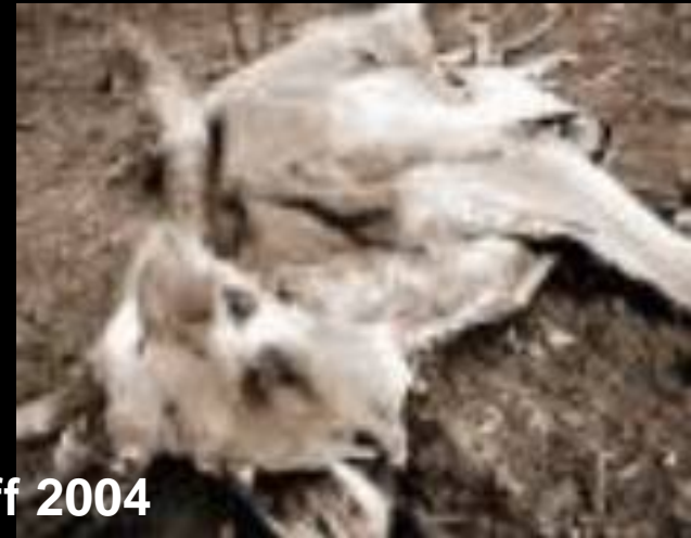
Sonora cattle die-off 2004