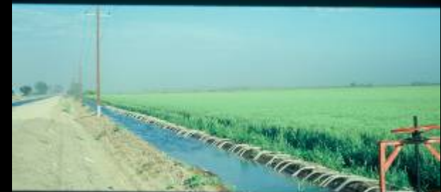
Rio Yaqui irrigation canal