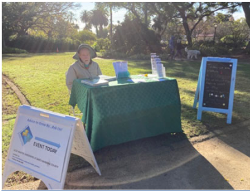
Information table with the butterfly garden in the background.

-Anonymous Victory Vegetable Garden (zoom) For True Beginners