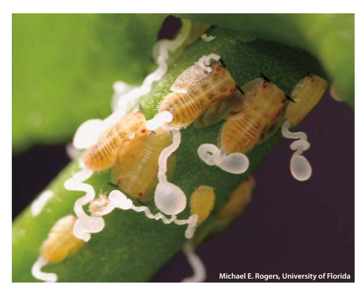
ACP nymphs excrete distinctive waxy tubules.