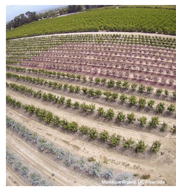
Red-dyed kaolin clay being trialed for its potential enhanced repellency to ACP in non-bearing citrus.