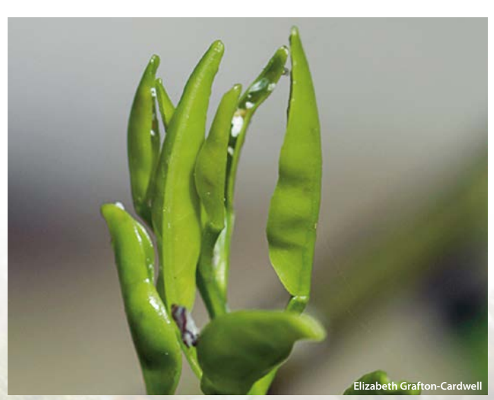
Twisted tips of citrus foliage caused by psyllid feeding.