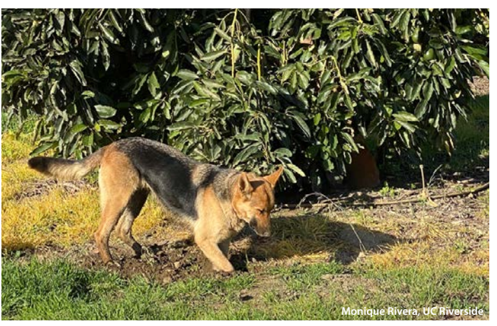
Canine early detection technology (EDT).

infected with other citrus pathogens (CTV and Spiroplasma citri ) is showing the unique impact CLas has on citrus metabolism. Translating the greenhouse work her team has done to the development of a biomarker test for use in the field, she has found markers for detecting the disease that have high sensitivity and specificity. Finally, her work has found interesting impacts of CLas on psyllid biology. These studies have greatly contributed to our understanding of the insect vector – pathogen – host pathosystem.