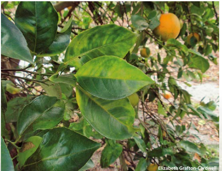
Leaves showing symptoms of HLB infection in Florida.