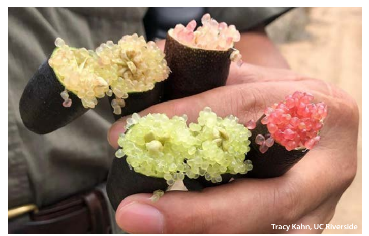
Australian finger lime (Microcitrus australasica) is resistant to HLB and is being used for breeding purposes. It was also the source of the SAMP identified by Hailing Jin's group.

The research group of Hailing Jin, professor in the Department of Microbiology and Plant Pathology at UC Riverside, has identified a stable anti-microbial peptide, SAMP, produced by HLB resistant or tolerant citrus relatives, which has the potential to be used in HLB disease management strategies. SAMP not only lyses the bacterial cell, but it could also induce the defense response to act as a "vaccine" for citrus trees. Preliminary results from greenhouse tests suggest that spraying or injecting a SAMP solution could protect citrus trees from CLas infection or suppress CLas in HLBpositive citrus trees. "Prevention is better than cure." Dr. Jin said. Her group and collaborators are developing the SAMP-based HLB management program to protect citrus varieties in California and Florida.