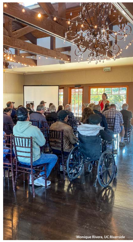
Citrus grower meeting in Riverside County.