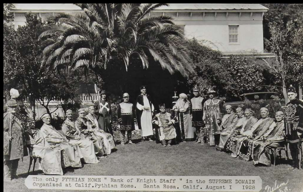
The Knights of Pythias seated in front of the Hood House.