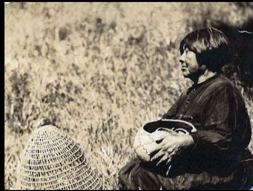
Wappo Woman

You are standing on the ancestral homeland of the Coast Miwok, Pomo and Wappo Peoples who have lived here continuously for more than 10,000 years.. The name Los Guilicos is a Coast Miwok word for the Wappo Village that once was located just east of here along Calabazas Creek.