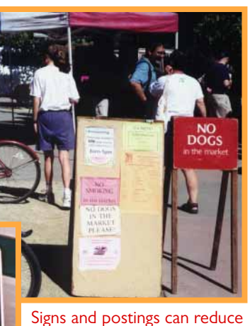
signs and postings can reduce risks associated with certain activities at the market.

and with local officials. Discuss each potential risk point by point and arrange to manage or reduce it. It may also be wise to contact your insurance carrier regarding any activities that go beyond the market's routine. This is especially true if the activities increase existing risks or add new exposures.