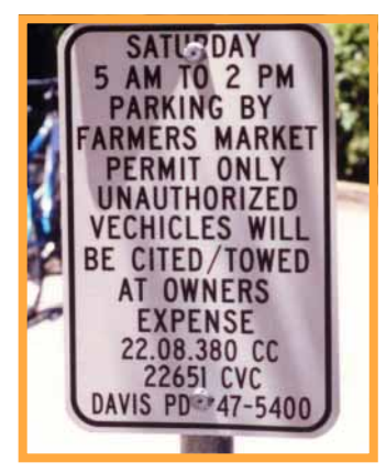
Special parking restrictions help to reduce accidents involving unauthorized vehicles entering or leaving the market.

devices, police personnel to regulate a crossing, or additional parking closer to the market?