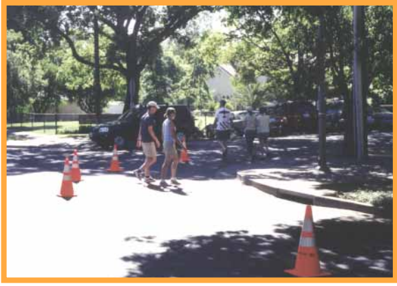
Traffic safety devices such as these cones help to protect pedestrians at busy crossings.

Parking and traffic issues are growing concerns at markets, and they often influence where markets can be established. Market management should consider these issues periodically as a market grows and particularly whenever a special event is planned. Other factors that can affect parking and traffic at and around the market include nearby construction projects and other events being held nearby.