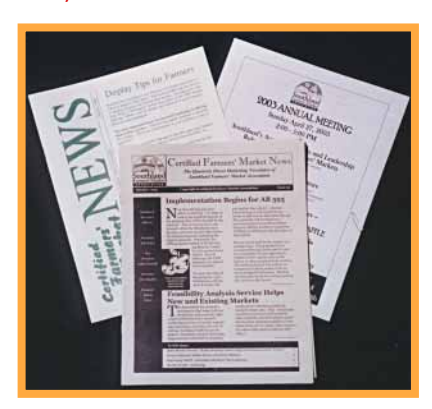
Newsletters and annual meetings educate vendors about safety issues and regulatory changes.

Delegating this monitoring to qualified, trained assistants and volunteers is appropriate, especially at larger markets, but volunteers cannot replace a manager's overall responsibility for foresight and enforcement of safety precautions.