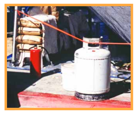
Vendor stalls where open flames or electricity are in use should be equipped with fire extinguishers.

Some activities require special permits.