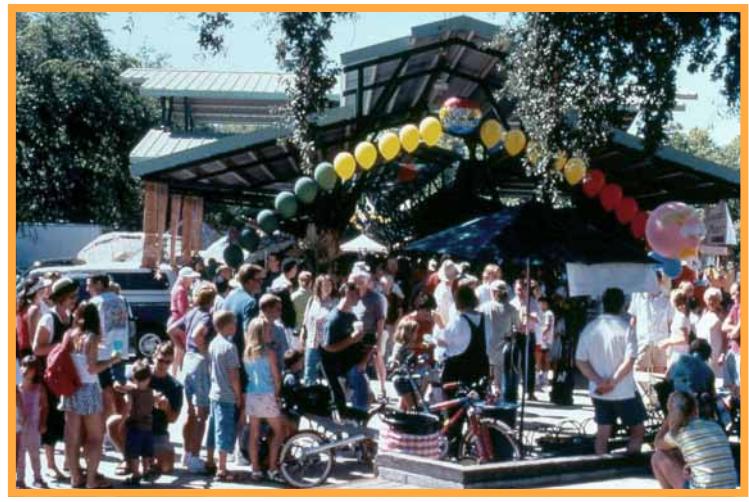
Special events often draw larger than usual crowds.

Managers of markets that offer petting zoos or other activities where people come in contact with live animals should review the California Department of Health Services' Guidelines for Reducing the Risk of Disease at Petting Zoos, Animal Exhibits or Other Areas Where the Public May Have Contact with Farm Animals.