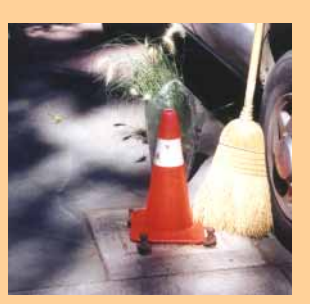
Any such hazards should be clearly marked.

Equipment failure and "trip and fall" accidents are the most common types of risks at farmers markets.