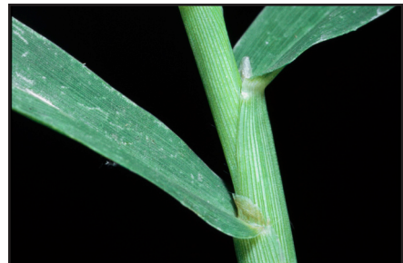
Figure 4. Smooth crabgrass collar region and sheath. The ligule at the base of the leaf blade is a short projection, and there are no auricles.