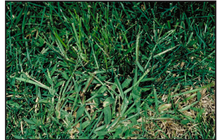
Figure 2. Large crabgrass in a lawn.

Seedling leaves are light green and hairy. True leaves are generally 3 inches long and hairy on the upper surface of the leaf and leaf sheath. The collar region and flower stalk are similar to that of smooth crabgrass, but the branches are longer—about 2 to 5 inches—at the end of the stalk. One source reports seed production from a single, large crabgrass plant can be as high as 150,000.