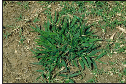
Figure 1. Smooth crabgrass.

Seedling leaves are light green and smooth (Fig. 3). They are very conspicuous in the lawn with their lighter green color. True leaves are dark green but still smooth, and the leaf blade is from \frac{1}{4} to \frac{1}{3} inch across, up to 5 inches long, and pointed. Crabgrass often forms patches in lawns, and plants can grow together to form large clumps. The projection at the base of the leaf blade, known as the ligule (Fig. 4), is small