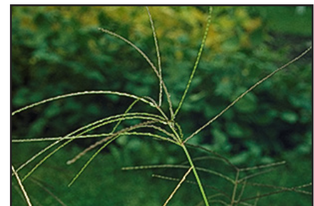
Figure 5. Flowering stem of smooth crabgrass.