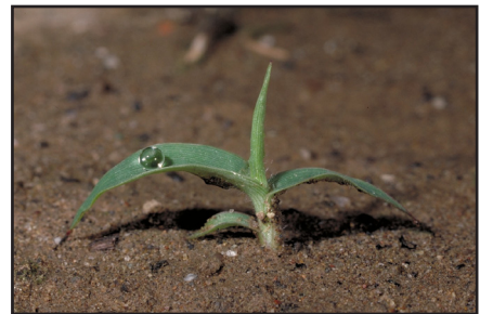
Figure 3. Smooth crabgrass seedling.