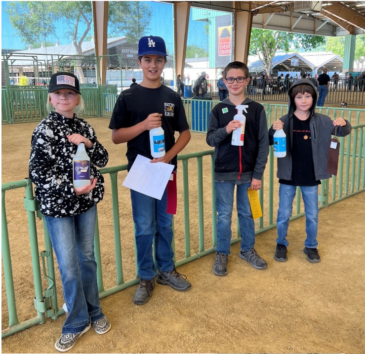
Top: Swine members with donated bottles