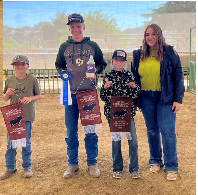
Bottom: Members with Ribbons & Judge