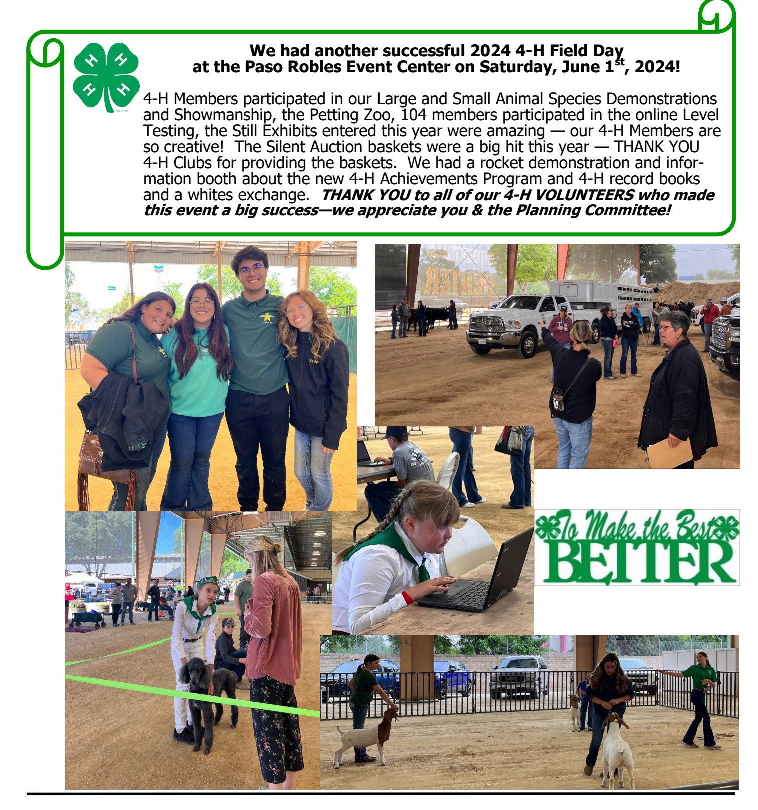
University of California, U.S. Department of Agriculture and San Luis Obispo County Cooperating