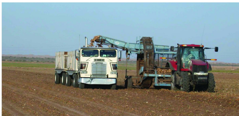
Figure 3. Harvesting over-wintered beets in Brawley, California, in June, 2008.

When sugar beet is treated as a fall planted crop in some areas of the world (sub-tropical and tropical, plus arid), including the Imperial Valley of California, it is planted late summer and harvested the following late spring and summer (210 to 300 days from planting). The advantage to growing winter beet is that yields can be much higher due to longer growing season (nine months instead of six or seven). In Mediterranean climates, Fall-planted beets have better water use efficiency than spring planted beets due to greater water use efficiency during periods with cooler temperatures and more frequent rainfall throughout the winter. Disease pressure also may be reduced. Disadvantages to growing winter beet include breeding for extreme tolerance to bolting because the cooler winter temperatures may approach the temperature needed for vernalization and flowering. Although the disease pressure may be reduced, there often is a different spectrum of disease and insect problems than seen in spring planted sugar beet, and winter beet hybrids must contain a different suite of resistances to these pests and diseases. Finally the logistics of harvest are more complicated because roots cannot be stored for more than a few days before processing (23, 24). Many of the specific practices are reviewed in Cooke and Scott (25) and Draycott (19). Irrigation of winter beet has been reviewed (26, 27).