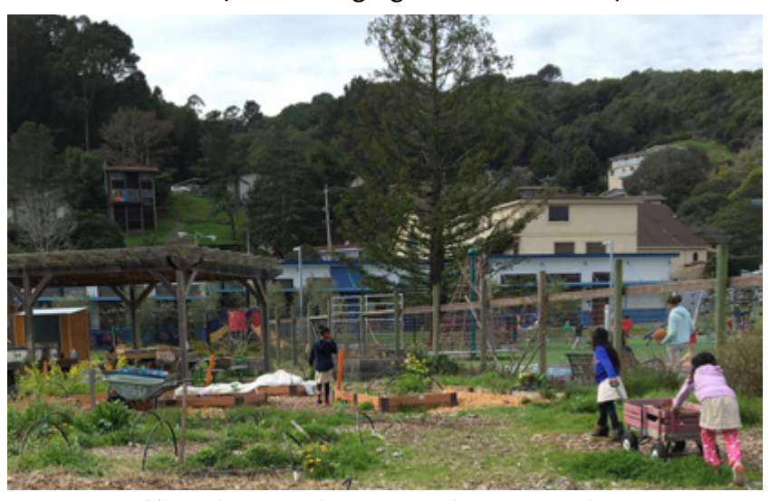
Top & bottom photos: Bayside Martin Luther King Junior Academy school garden, Marin City

Sausalito/Marin City School District school, Willow Creek Academy, coming on board in 2015. Recently, Good Earth grocers' school lunch program adopted CK's criteria in their fifteen schools, and they are currently working to expand in the Bay Area and the State... The program includes scratch-cooked breakfasts, lunches and snacks prepared by a chef in a full service kitchen with food from local farmers and the gardens. Students become "Conscious Kitchen Ambassadors" in their community, encouraging a healthier lifestyle for all!