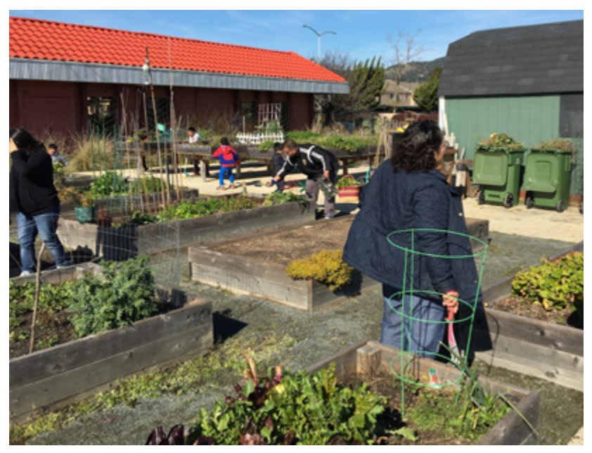
Top & bottom photos: Canal Neighborhood Community Garden, San Rafael

trees, composting, and continued enthusiasm. Taking longer to establish, but equally lively, San Rafael's 90-plot Canal Community Garden continues to thrive providing much appreciated produce for its gardeners.