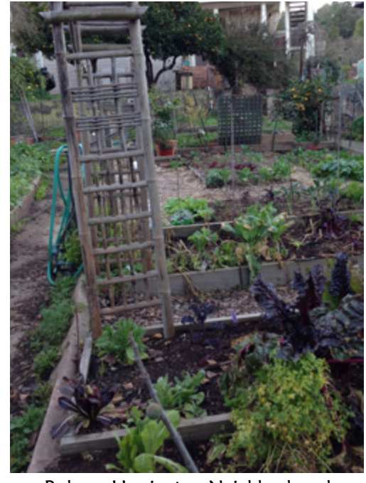
Robson-Harrington Neighborhood Community Garden, San Anselmo

After two and a half decades, the Fairfax Community Garden on Fairfax Library land still has a waiting list, but was recently spruced up, making it a bit more secure from "gopher gardeners"! Marshall's community garden has no waitlist, but needs some loving care from willing locals -- Are you one? Marin's other longestablished community gardens in Marin City, Point Reyes Station, San Anselmo, Terra Linda and Larkspur continue to flourish, and a second