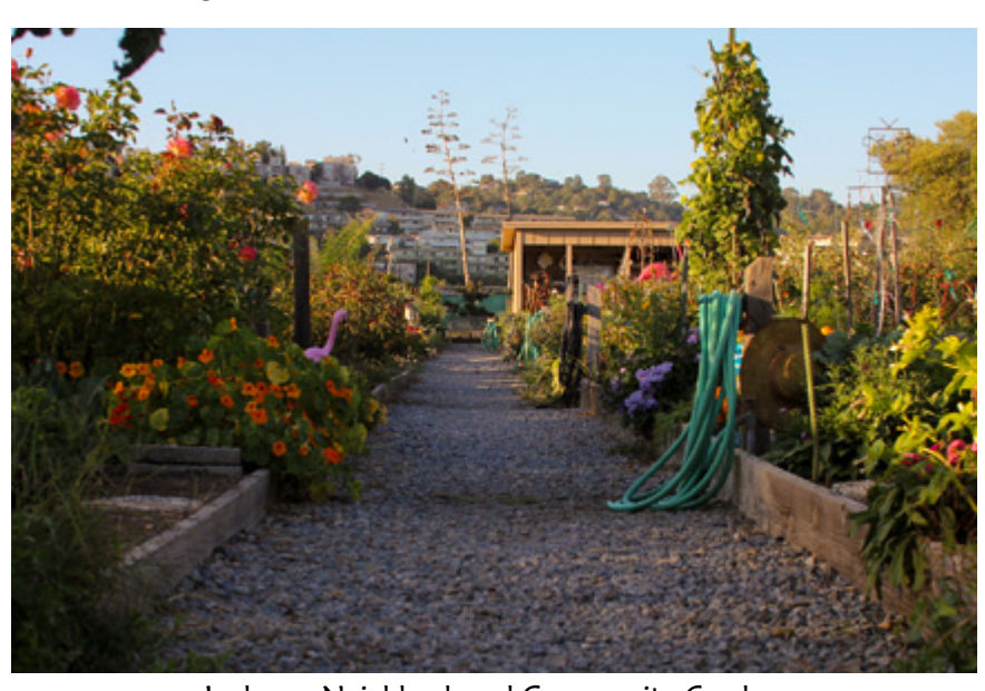
Larkspur Neighborhood Community Garden

community garden in Mill Valley is nearly complete!