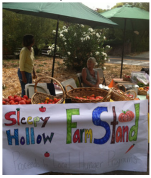
Sleepy Hollow Presbyterian Church Farm Stand

request. With part of the SHPC mission "to help the hungry and homeless" in mind, inspiration took over, and, with the full support of the entire church community and Reverend Beverly Brewster, the garden produced more than 1000 pounds of vegetables in the first year. All of it was donated