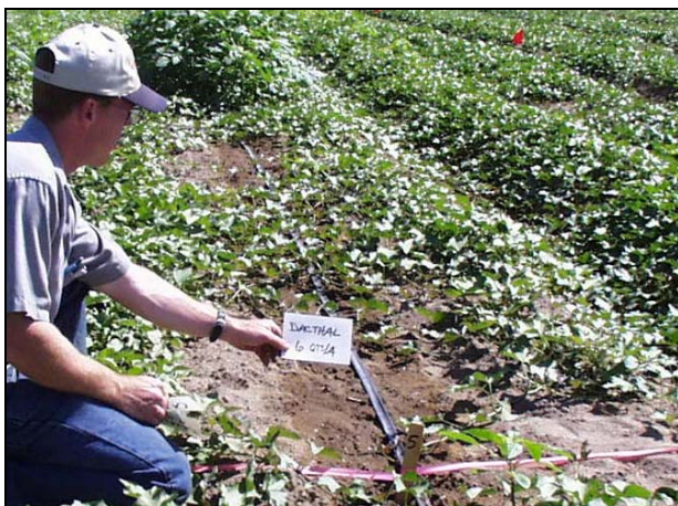
Figure 5. Dacthal 6 qts/A.