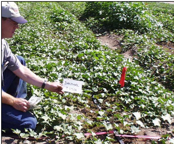
Figure 4. Dacthal 3 qts/A.