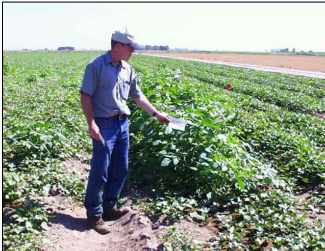
Figure 1. Treatment 1, untreated control (UTC) on Aug 6.

CV = coefficient of variation, a measure of the variability in the experiment.