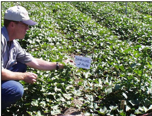
Figure 2. Treatment 2. Devrinol 2 lbs/A.