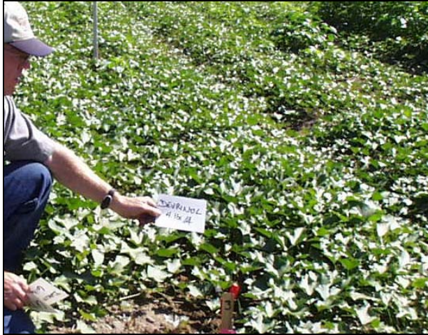
Figure 3. Treatment 3. Devrinol 4 lbs/A.