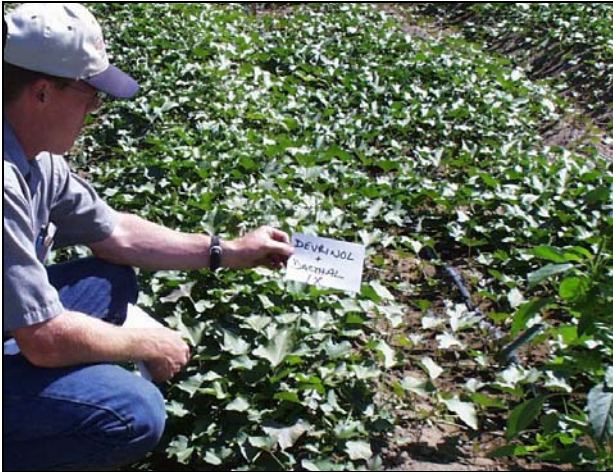
Figure 6. Treatment 6. Devrinol 2 lbs + Dacthal 3 qts/A.