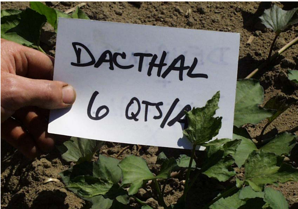
Figure 7. Leaf distortion caused by the high rate of Dacthal.