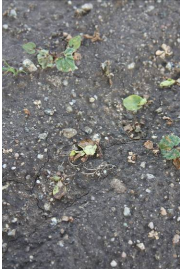
7 - Weed Zap