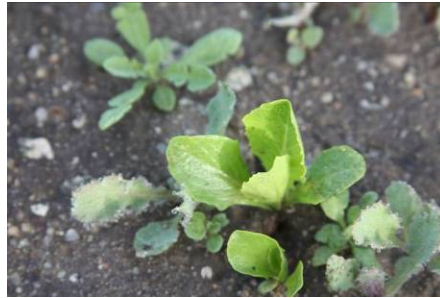
2 – Dew present on plants at application