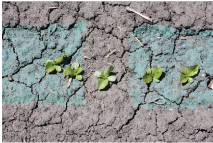
1 – Example of lettuce thinning with spray application (blue area) from a commercial field

Photos of the plot of the 14 days after germination water applications on October 2