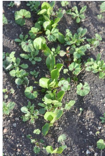
12 - Untreated