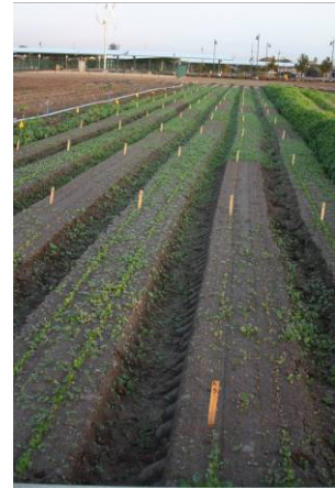
3 – Over view of plot