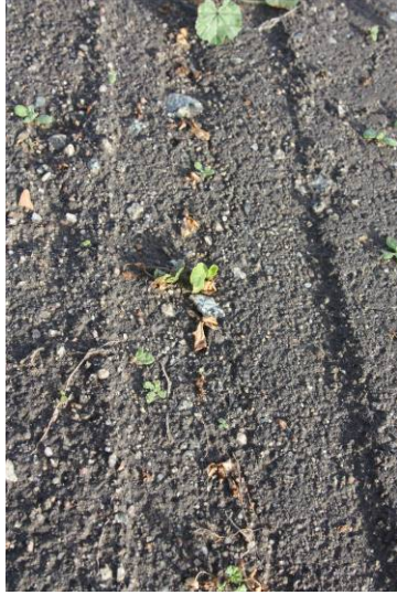
8 - Scythe