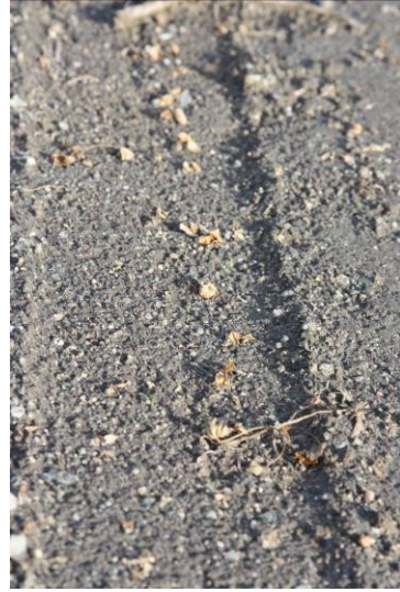
9 - Shark