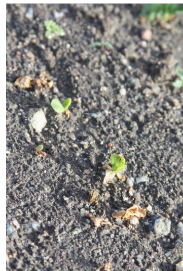
6 – Weed Pharm