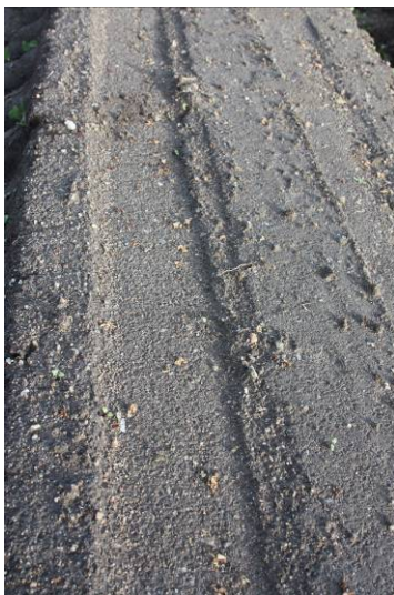
4 - BioLink herbicide