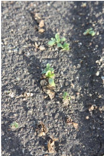
10 - NpHuric