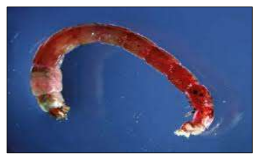
midge fly larva