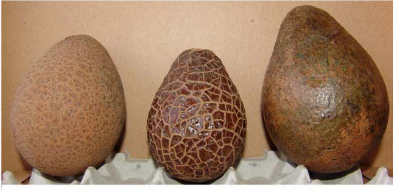
Photo: Avocado thrips damage, carapace damage and greenhouse thrips damage.

Sunblotch - This is a viroid that can affect fruit, leaves, and stems with a yellow or reddish streaking, cause a compacted growth and willowy growth habit. The streaking in the fruit is usually depressed and doesn't extend the length of the body.