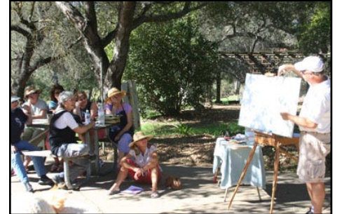
Pruning Class Ojai Community Demonstration Garden

Ventura College 4667 Telegraph Rd, Ventura 805/654-6400 http://students.vcccd.edu/catalogs.htm Search the class guide for the college's current offerings.