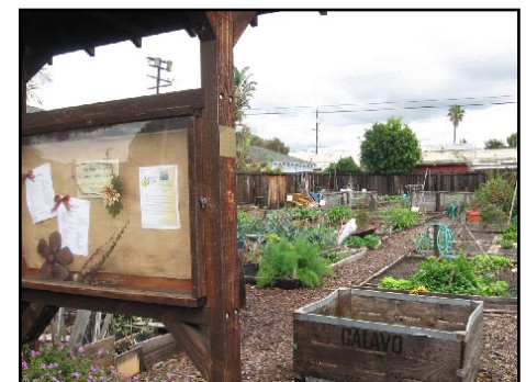
Jordan Avenue Community Garden