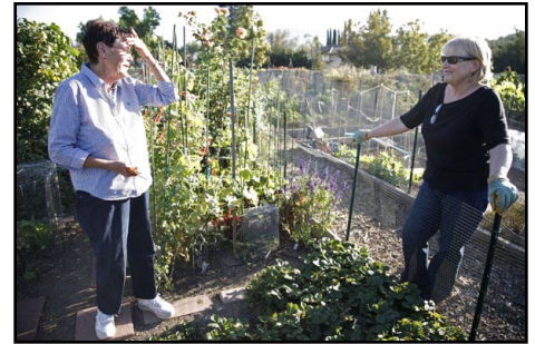
Oak Park Community Garden