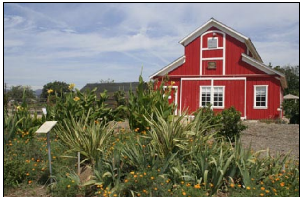
Faulkner Farm, Santa Paula Home of the UC Hansen Agricultural Center

Search the class guide for the city's current offerings.