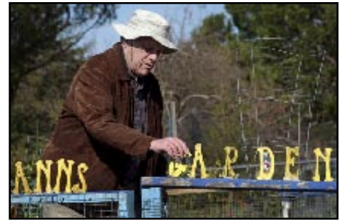
Las Flores Community Garden

Meet 1st Wednesday of month, 1:00 pm. St. Pauls Episcopal Church 177 N, 7 th St, Santa Paula