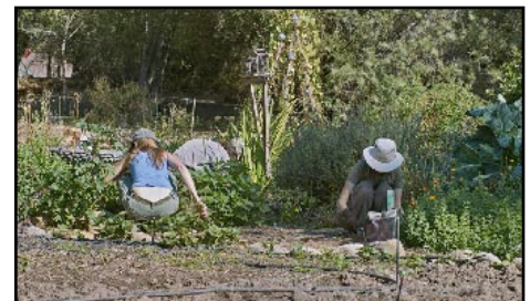
Ojai Community Demonstration Garden