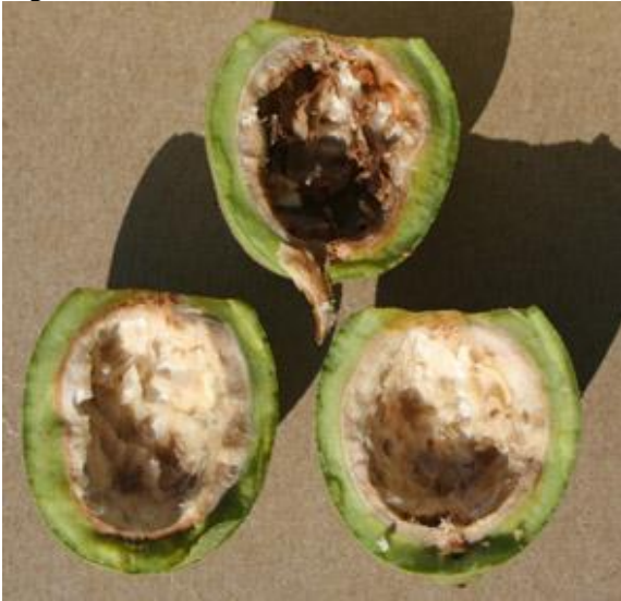
Figure 1. Immature walnuts