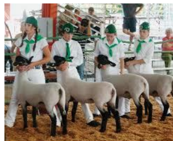
Participants in the Shasta County 4-H program exhibit their project lambs at the Shasta District Fair.

Fairs provide opportunities for members to exhibit the best of their project work from the past year and see how their skills have grown. Fairs also share with the community what UC 4-H activities are taking place in their area. Each fair is governed by a set of rules that should be carefully reviewed by UC 4-H staff. Most fairs are not run by UC 4-H. Entering UC 4-H projects in county, district, and state fairs is the responsibility of the UC 4-H members. They should contact their project leaders to obtain necessary forms, help with completion of forms, and required signatures. Members are responsible for turning in their entries on time. It is the member's responsibility to find out the rules of a fair and follow them, while representing UC 4-H and following UC 4-H Code of Conduct. See more information about UC 4-H and fairs online at http://4h.ucanr.edu/4-H_Events/CountyFairs