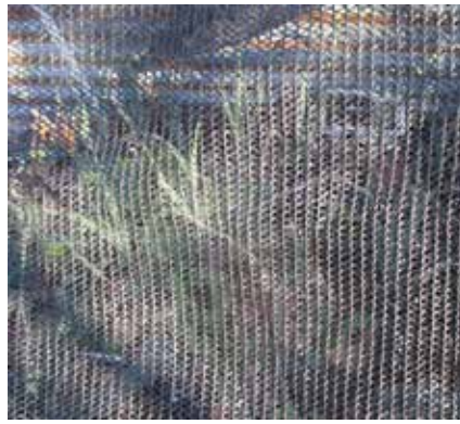
Knitted shade cloth

Whatever structure and cover combination you choose, the added protection will allow you to grow cold tolerant vegetables