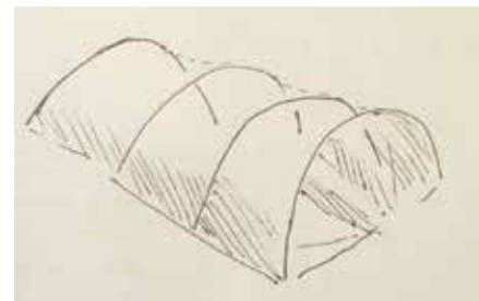
Low tunnel with row cover

The big disadvantage of the rigid cold frame covers or polyethylene is that they do not vent to keep heat from building up during sunny days, possibly cooking your vegetables prematurely. For tunnels, you will need to be able to roll up at least one side to vent the structure on any sunny day warmer than about 45F. There are automatic openers available for cold frames. Although that adds expense, it makes them practical