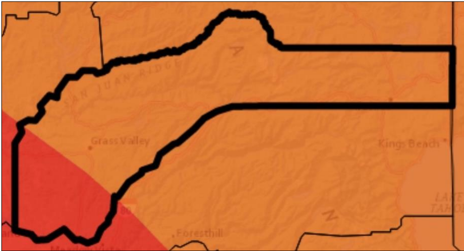
Drought Stages on 2022-07-19