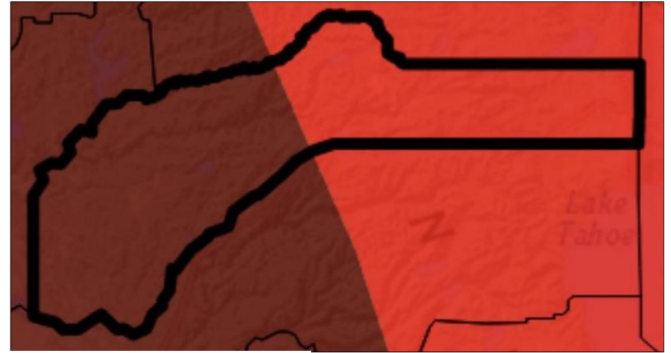
Drought Stages on 2021-10-19