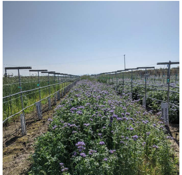
Cover crop trial in Parlier.